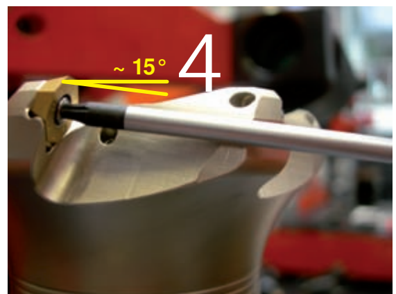
4 Tighten the screw. Position the screwdriver along the centreline of the screw.