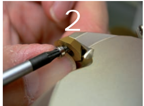
2 Push insert and screw into the insert pocket. Tighten the screw slightly.