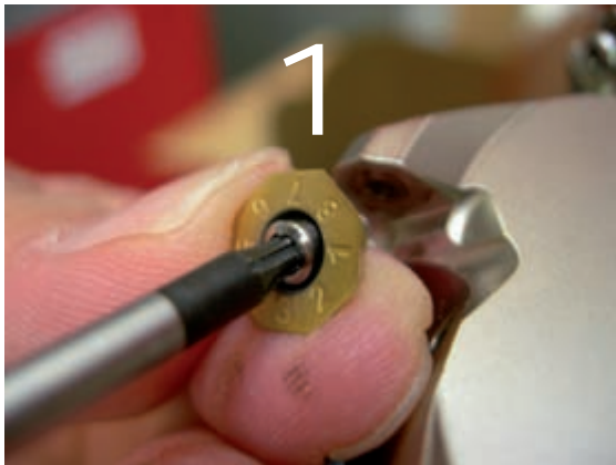
1 Place the screw into the hole of the insert.