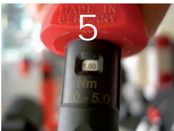
5 Use a torque screwdriver with 1.6 Nm/14.2 in.lbs.: DMSD 1,6Nm/SORT 08IP